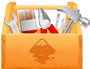
Toolbox for proposers