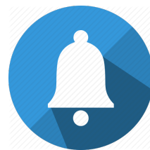
Personalised weekly notification