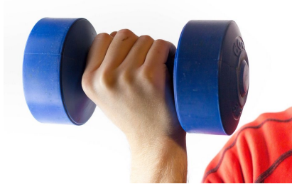
Trainings, Seminars & Webinars