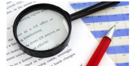
Full proposal check & Project idea check